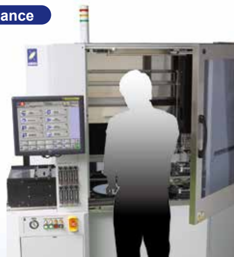
The large door and processing space increased the maintainability.