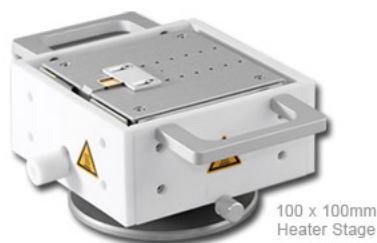
100 x 100mm Heater Stage