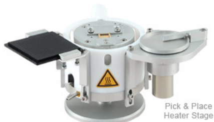
Pick & Place Heater Stage