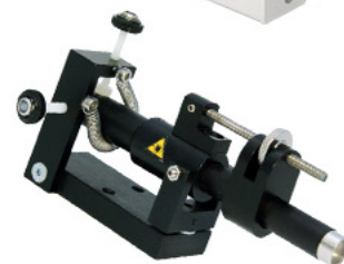
Spotlight Targeting System