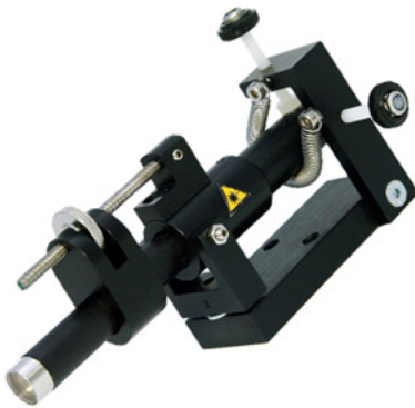
Spotlight tagetting system